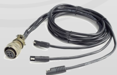
BTA-70857-2B SOLAR INPUT CABLE

*Additional solar options available upon request