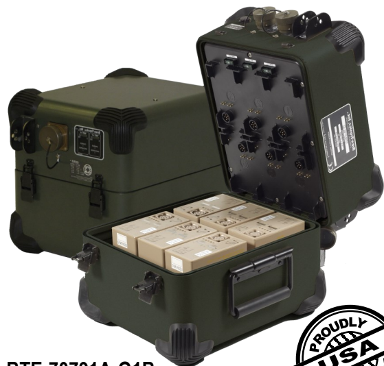
BTE-70791A-G1B 6-PACK, GREEN