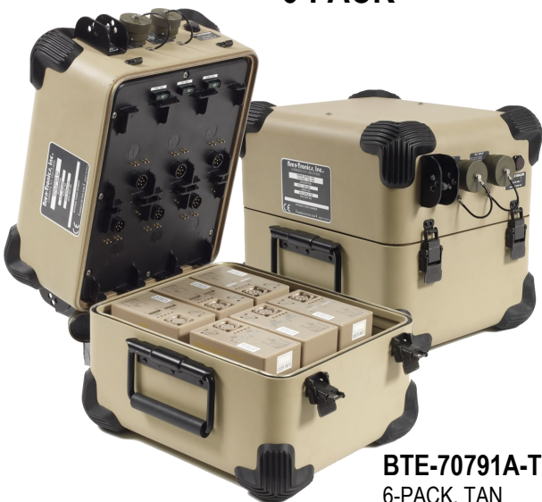
BTE-70791A-T1B 6-PACK, TAN