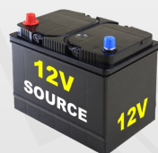
12V POWER SOURCE