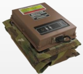
2-Panel FLEX Charger® *Displayed folded