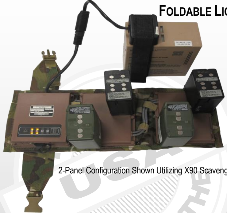
2-Panel Configuration Shown Utilizing X90 Scavenger

FOLDABLE LIGHTWEIGHT EXPEDITIONARY CHARGER®