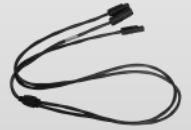
BTA-70797 Y-Junction Cable