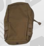
BTP-490022 Molle Bag *Included in kit