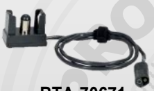
BTA-70671 24V Input Cable, NATO *Included in kit