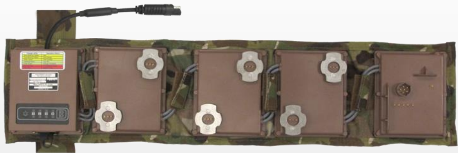
BTC-70911-13 4-Panel FLEX Charger®