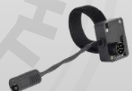
BTA-70768 X90 Scavenger *Included in kit