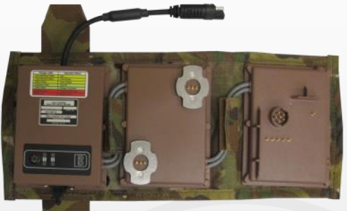
BTC-70911-9 2-Panel FLEX Charger®

FOLDABLE LIGHTWEIGHT EXPEDITIONARY CHARGER® A VERSATILE SOLUTION FOR TACTICAL CHARGING