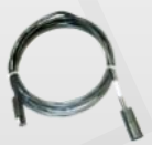
BTP-390651 8FT Extension Cable *Included in kit