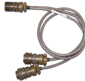
Figure 1-3.4 BTA-70816 (CX-13560/G) For use with DC Hummer Cable