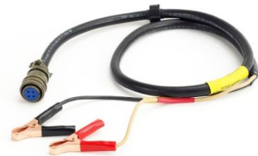
Figure 1-3.2 BTA-70844-24AL