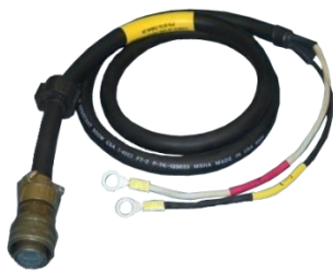
Figure 1-3.1 BTA-70844-24