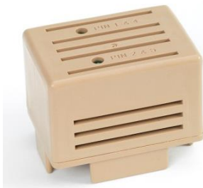
Figure 1-3.5 BTF-70791 (PP-8497/U)