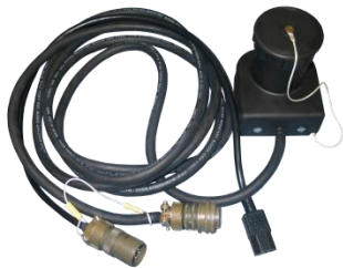
Figure 1-3.3 BTA-70835 (J-6362A/U)