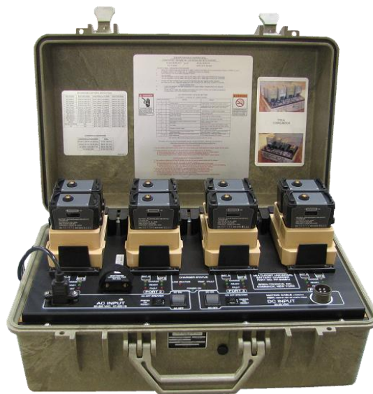
Figure 1-5.1 - SPC Typical Configuration

Two independent charging channels, designated A and B, can charge one battery at a time. Upon charge completion of the first battery, each channel sequentially charges up to three additional batteries that are waiting in queue. Sequencing to the other three Ports is performed completely automatic and requires no intervention by the user. While the four batteries charged by the A channel are located at either the rear or left side of each adapter Port (depending on the adapter type), the four batteries charged by the B channel are located at either the front or right side of each adapter Port. This is readily seen in Figure 1-5.1.