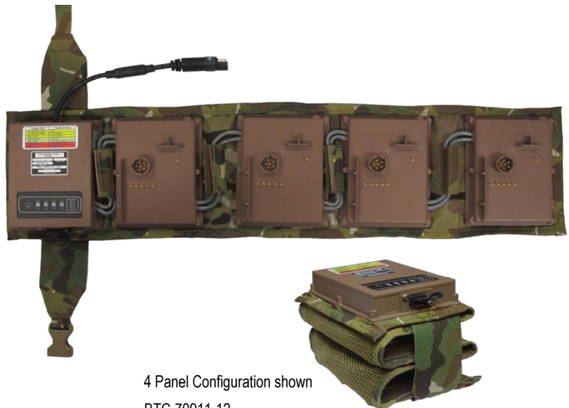
4 Panel Configuration shown BTC-70911-12