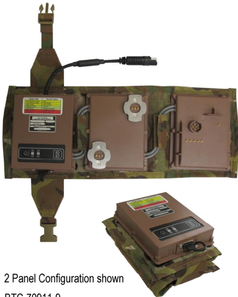
2 Panel Configuration shown BTC-70911-9